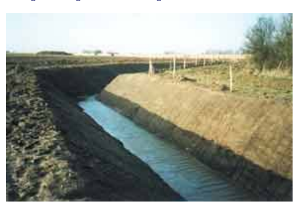
Completed channel section during the germination process