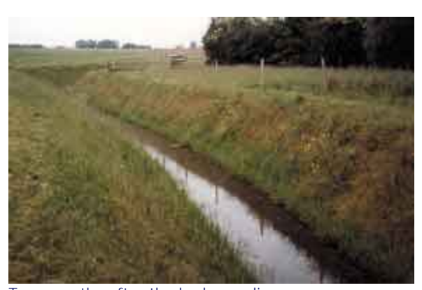
Tree months after the hydroseeding